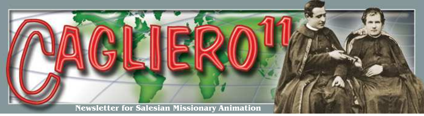
A Publication of the Missions Sector for the Salesian Communities and Friends of the Salesian Missions