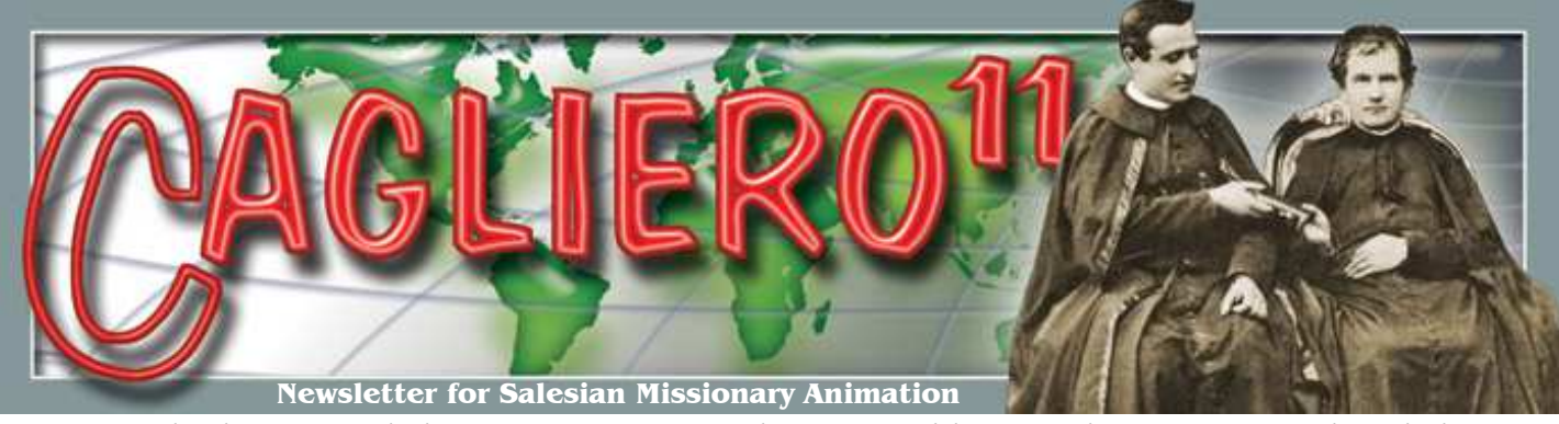
A Publication of the Missions Sector for the Salesian Communities and Friends of the Salesian Mission