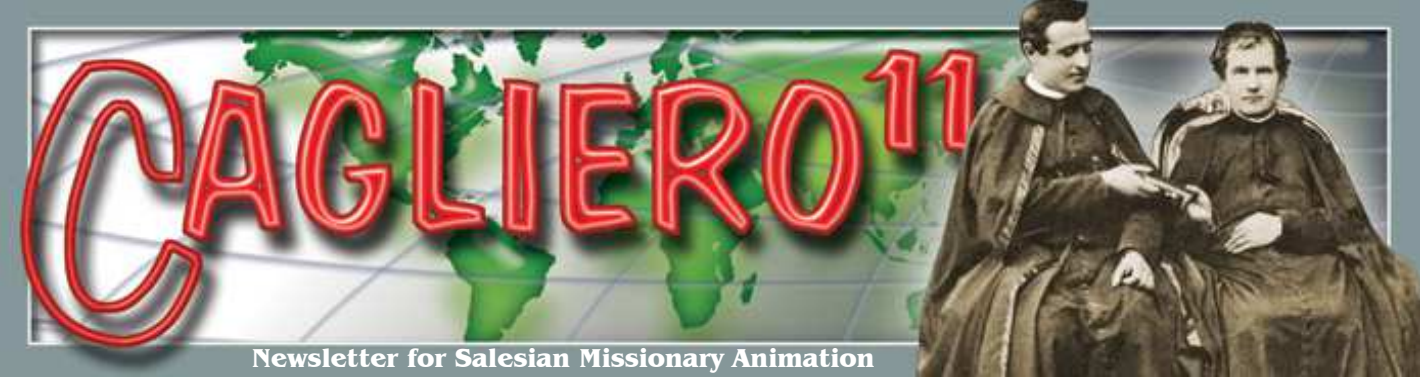
A Publication of the Missions Sector for the Salesian Communities and Friends of the Salesian Mission