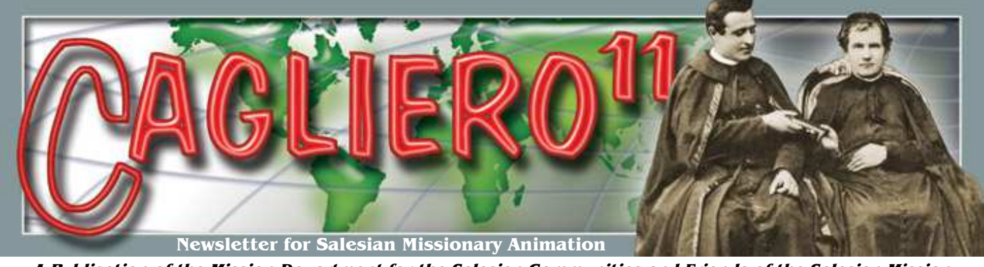
A Publication of the Mission Department for the Salesian Communities and Friends of the Salesian Mission