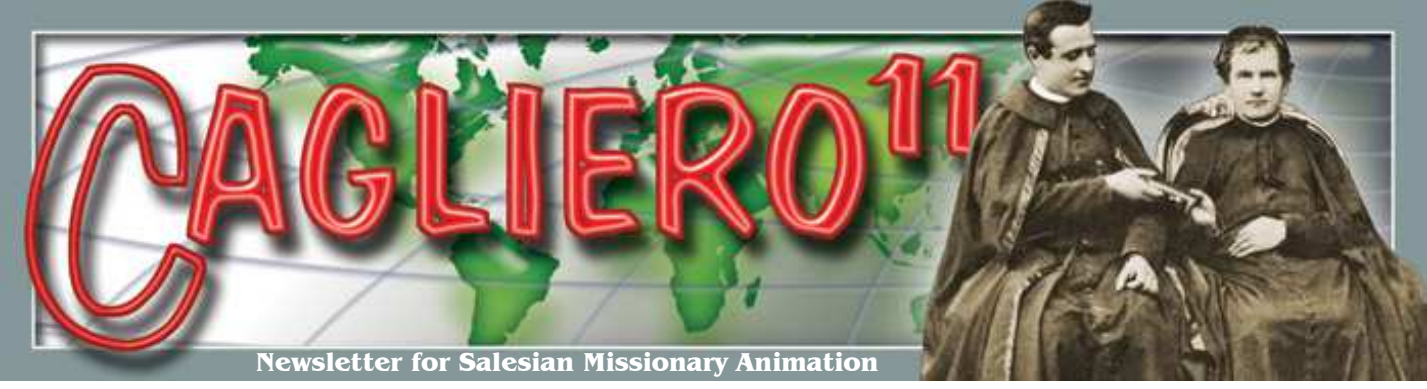
A Publication of the Missions Sector for the Salesian Communities and Friends of the Salesian Mission