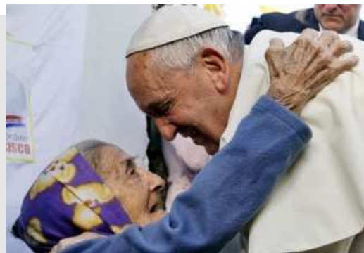
Pope Francis Angelus, 3 July 2016

“Let us pray to the Lord, through the intercession of the Virgin Mary, that the Church may never lack generous hearts that work to bring everyone the love and kindness of our heavenly Father.”