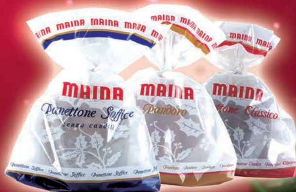
傳統 Panettone 不含糖果脯，含葡萄乾 MA1 (510245) / 700g