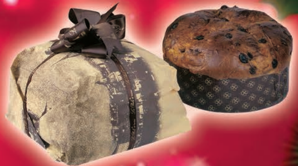
La Perla Tradizionale 意大利傳統 LP7 (107483) (花紙包裝) / 500g LP8 (107484) (袋裝) / 500g