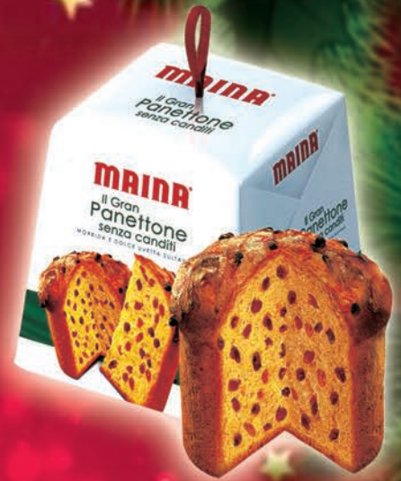
傳統 Panettone 不含糖果脯、含葡萄乾 MA6 (510045) / 1,000g MA7 (510056) / 100g