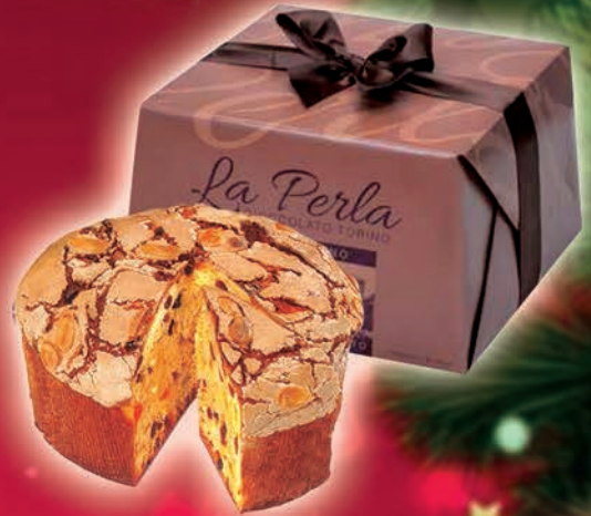
Antica Torino 都靈傳統 LP1 (108369) (禮盒) / 1,000g LP2 (100967) (袋裝) / 1,000g

La Perla has long treasured its rich heritage of good cakes and chocolates. This year they continue to offer a variety of holiday food selections highly favored by gourmets of East & West.