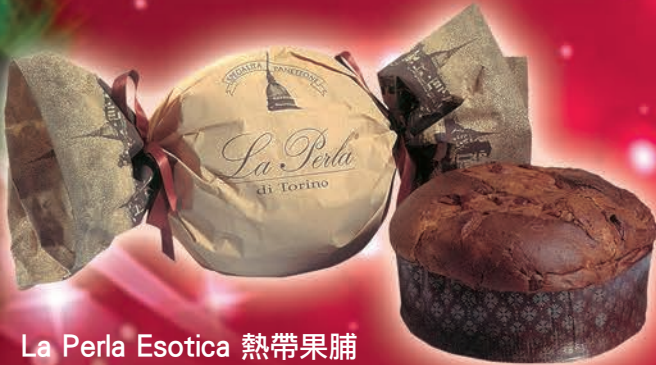
La Perla Esotica 熱帶果脯 LP3 (100904) (花紙包裝) / 1,000g LP4 (100970) (袋裝) / 1,000g