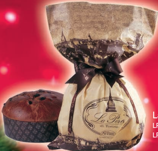
Pandoro 傳統軟身 LP9 (100906) (禮盒) / 1,000g LP10 (100692) (袋裝) / 1,000g