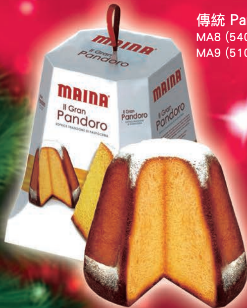
傳統 Pandoro MA8 (540210) / 700g MA9 (510310) / 80g