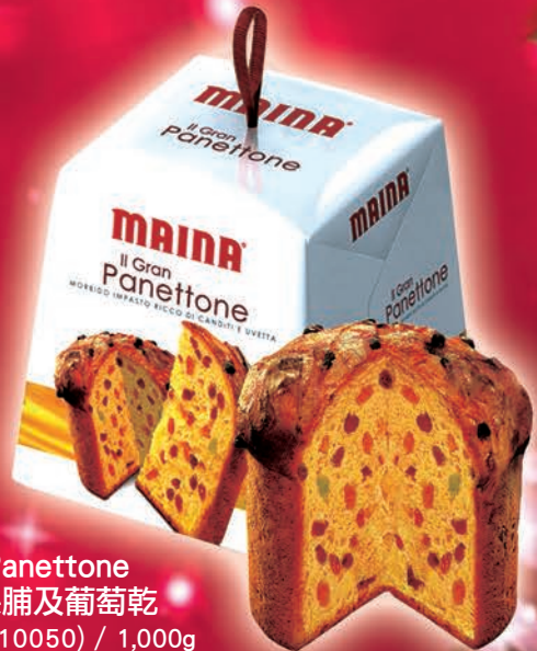
傳統 Panettone 含糖果脯及葡萄乾 MA4 (510050) / 1,000g MA5 (510060) / 750g