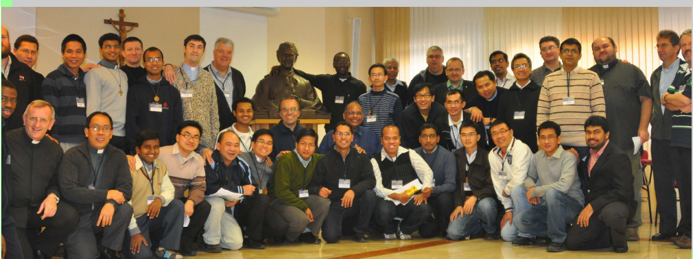
Participants at the first meeting of the Salesian missionaries in Europe - Pisana, Nov 25-27, 2011

All this should help the Salesians who are working in this context to achieve a way of thinking that is more and more European, strengthening the synergy among Provinces in the different sectors and re-enforcing collaboration at Regional level». What contribution can I make. then. to Project Europe?