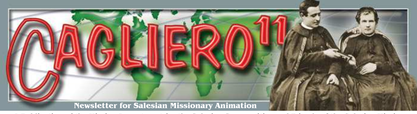
A Publication of the Mission Department for the Salesian Communities and Friends of the Salesian Mission